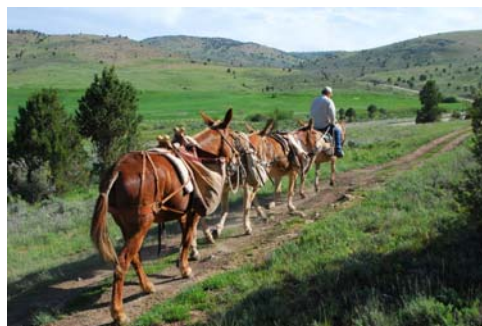
Hauling in Gravel

For more information on BCHU and events, rides and projects in your area, see their website at www.bchu.com or call Craig Allen at 801-388-1175