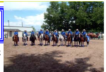
Aces Wild prior to their performance at the Hooper 4th of July celebration.