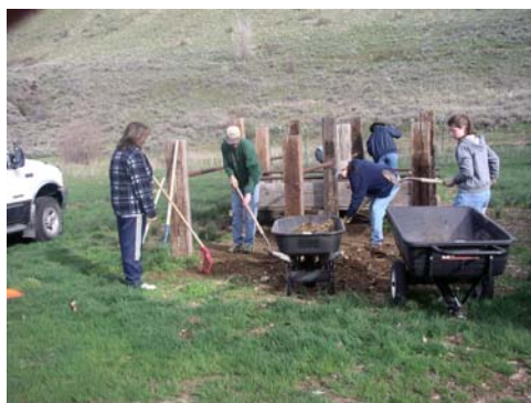
Cleaning up a Trailhead